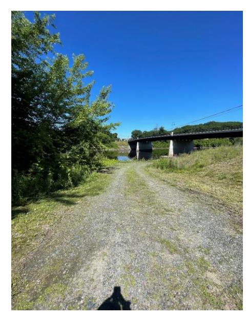
Access/Staging Area (town owned) at site of DV-01 (June 2021)